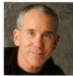
Dan Millman Author of Way of Zen Author of Way of Zen Author of Way of Zen Author of Way of Zen