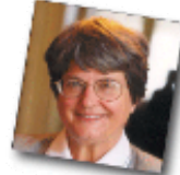
Sister Helen Prejean Author of Dead Man Walking Author of Dead Man Walking Author of Dead Man Walking

KEYNOTE SPEAKER: Natalie Goldberg Author of Writing the Buddha and Writing the Zen Author of Writing the Buddha and Writing the Zen Author of Writing the Buddha and Writing the Zen